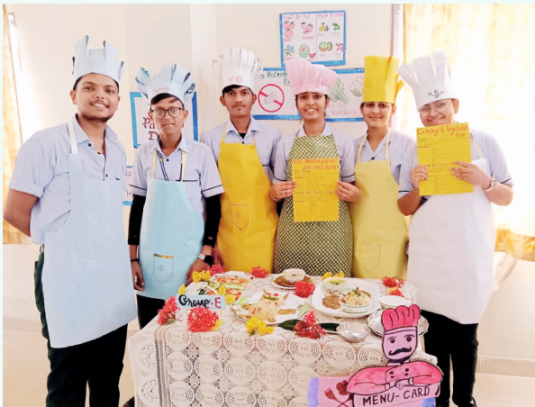
Students present their dietary preparations!