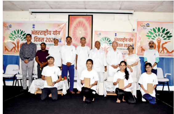
Students win awards on International Yoga Day