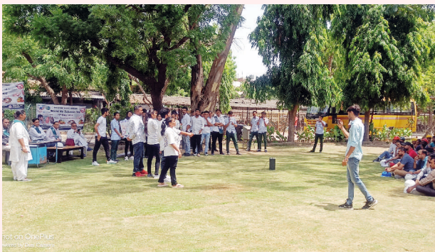
A short drama presentation on World No Tobacco Day